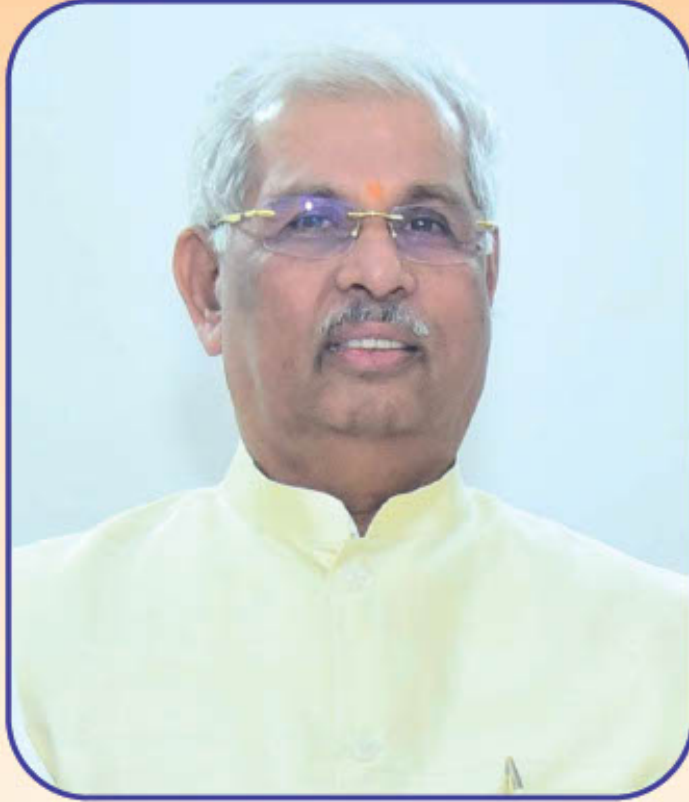
Hon'ble Shri Rajendra Vishwanath Arlekar Chancellor-cum-Governor of Bihar